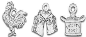
Rooster Chaps Chicken Soup

25 Roosters Country Kitchen 1515 Southgate 541-966-1100 Daily 7am-8:30pm